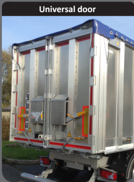
Universal door of various thicknesses closed by bolts and gate.