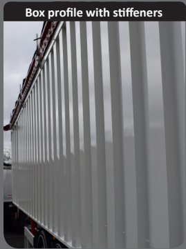
Box profile with stiffeners that provides minimisation of deformation while optimising the weight of the vehicle.