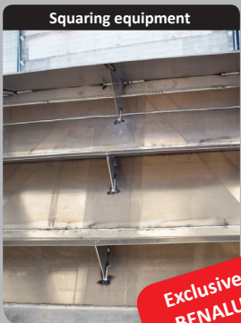
More than 15 pieces of equipment specifically suited to the squaring trade.