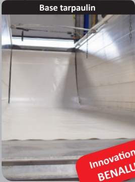
Base tarpaulin equipment designed to ease the flow of products that are sticky and ensure total safety (Patent no. FR2976532)