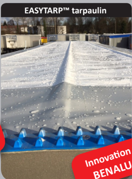
EASYTARP™ electric tarpaulin totally automated by radio-control. (Patent no. EP2878551)