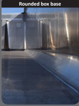
Limits the retention of product for tipping and encourages run-off.