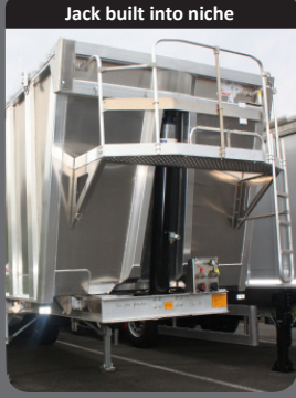
Jack with built-in eye in niche which optimises the total volume.