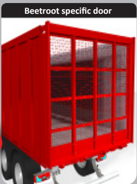
Innovative door, specifically design to transport beetroot.