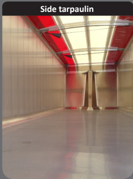
Side tarpaulin for fastening by straps suitable for all types of door.