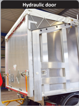
Single- or double-acting hydraulic door.